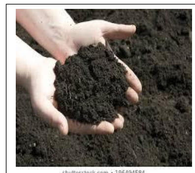
LOAMY SOIL OR GARDEN SOIL