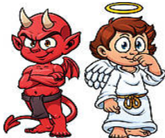
BAD / GOOD