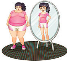
FAT / SLIM