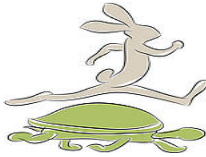
FAST / SLOW