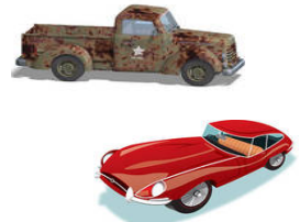
OLD / NEW