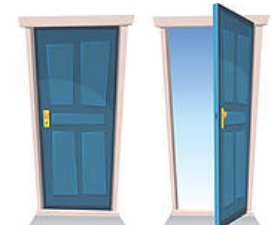
CLOSED / OPEN