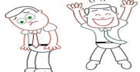
SAD / HAPPY