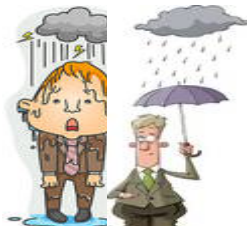
WET / DRY