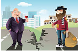
RICH / POOR