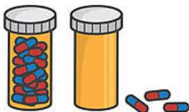
FULL / EMPTY