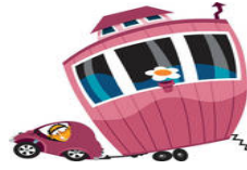
SMALL / BIG