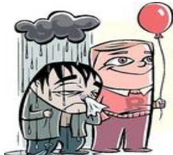
SICK / HEALTHY