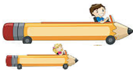
LONG / SHORT