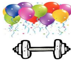
LIGHT / HEAVY