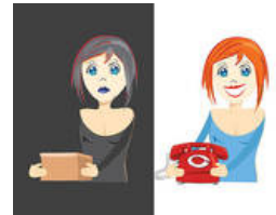
DARK / LIGHT