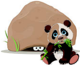
HARD / SOFT