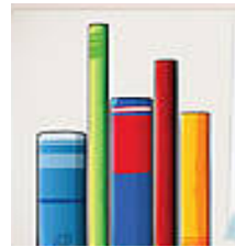
THIK / THIN