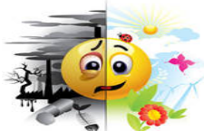
DIRTY / CLEAN