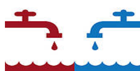
HOT / COLD