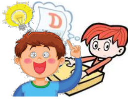
CLEVER / STUPID