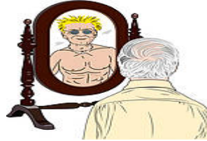
YOUNG / OLD