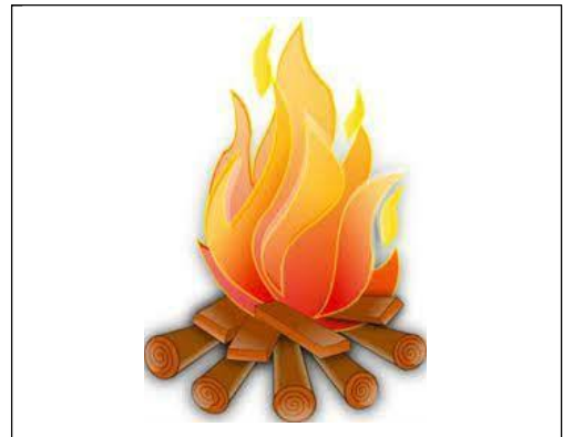
b. Crackling of fire