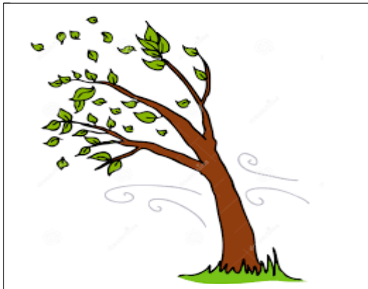
a. Rustling of leaves